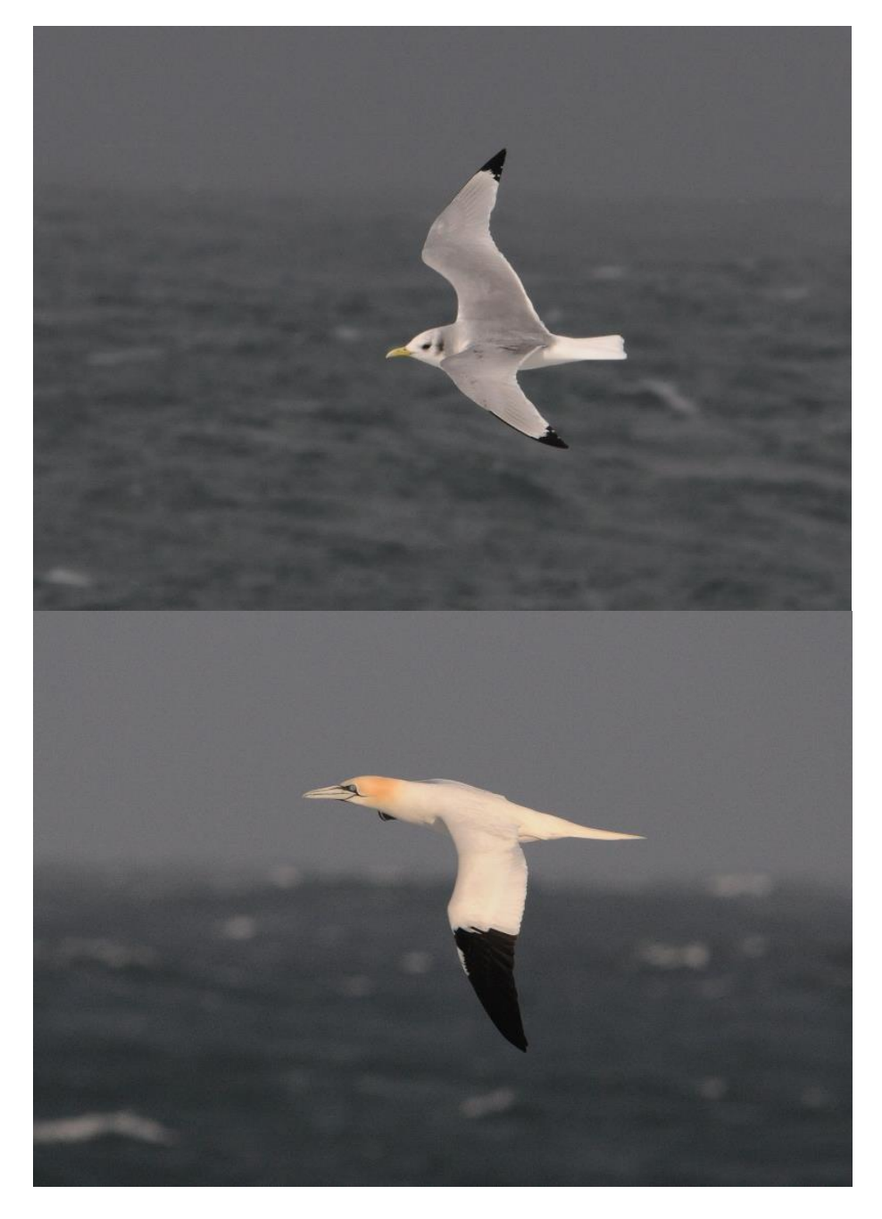
Kittiwake and Gannet, Rubha Ardvule, S Uist. The dark and stormy seas of the west coast of Scotland make a great back drop for seawatching.

of Britain move in a northerly direction, particularly the more pelagic species such as the shearwaters. This is thought to be the result of birds reorientating after having previously been displaced into the southern North Sea by strong northerly winds.