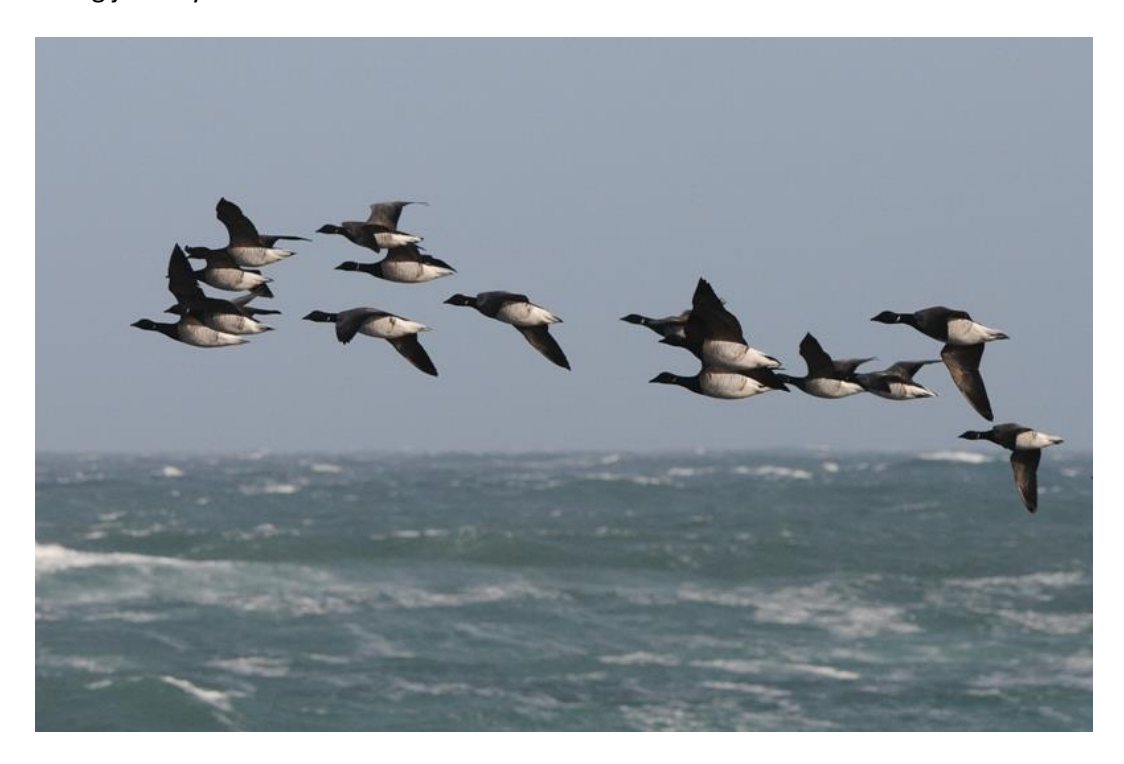
Pale-bellied Brent Geese on their way from Canada to Northern Ireland, Rubha Ardvule, S Uist.

The great thing about visible migration from a bird watcher's perspective is that if birds are moving by day – then provided they are not high in the heavens, then they can be seen by anyone armed with binoculars or telescope. So rather than inferring what birds have been migrating overnight by what turns up in the bushes at dawn, you can actually watch the birds in the very act of migration. And so we can enjoy the magic of migration in action. As the years have passed, my desire to find Thrush Nightingales and Blyth's Reed Warblers has waned, but my appetite for connecting with migration in action has grown ever stronger. Every migration journey is a minor miracle of endeavour and navigation, each worthy of an Olympic medal. But I'd rather watch Usain Bolt in the act of running the 100m final than see him standing around receiving his medal "after the event". So it is that I, and a growing band of "vismig" watchers have become tuned to observing visible migration rather than turning up for the medals ceremony for nocturnal migrants whose achievements cannot be witnessed. Whilst Eastern Crowned Warblers will always take the Gold Medal for most birders, the real magic of bird migration for me is connecting, however briefly, with the amazing journeys that can be seen in action.