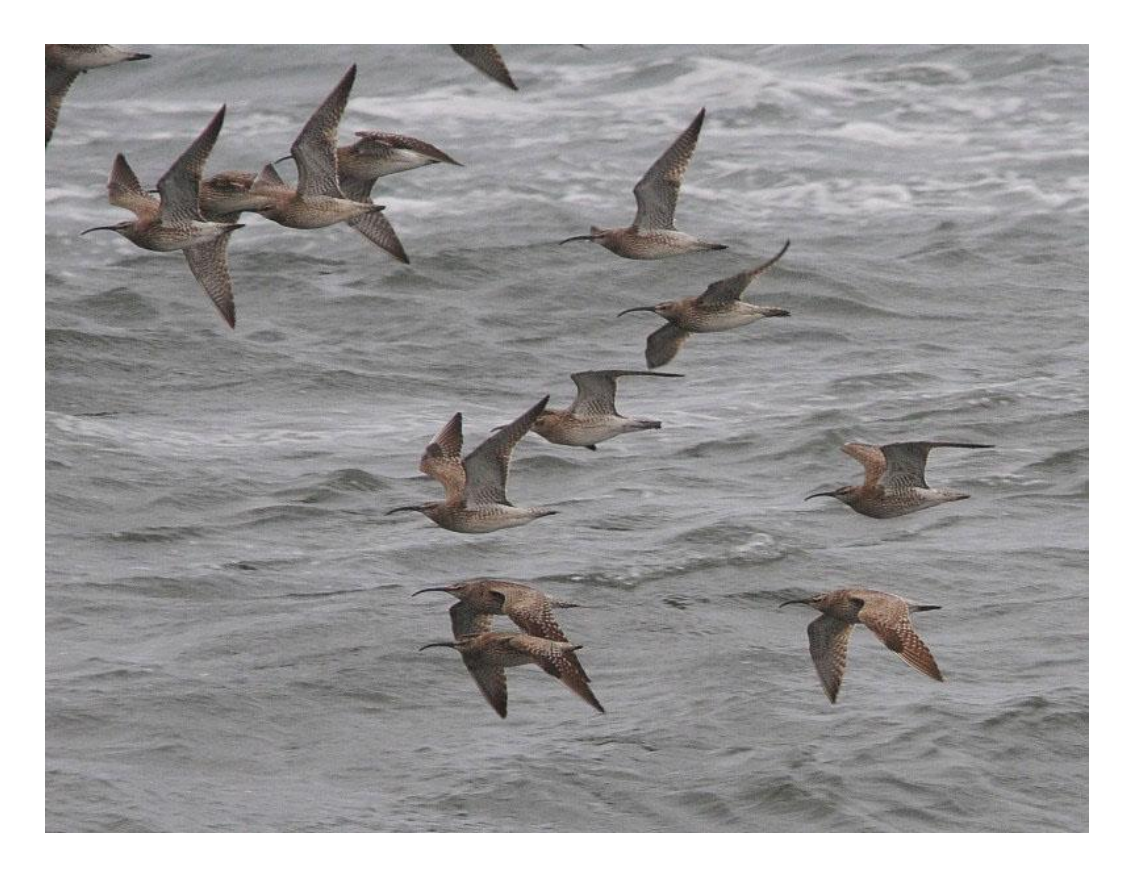
Whimbrels from Iceland passing Rubha Ardvule, South Uist 17th August 2013.