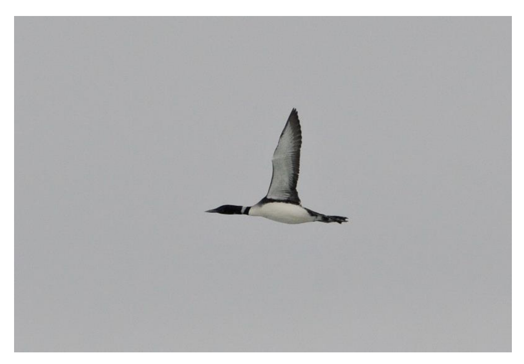
Great Northern Diver in summer plumage. Rubha Ardvule, South Uist.

And visible migration can be witnessed across the country, it is not the preserve of east coast headlands and remote islands. I have been enthralled by flocks of moving thrushes and finches in the valleys of the Peak District, Pale-bellied Brent Geese, Great Northern Divers and Sabine's Gulls off the coast of Islay in westerly gales, Whooper Swans and Woodpigeons on high pressure days in the Angus Glens and Meadow Pipits, Kestrels and Marsh Harriers following the peninsula at Spurn on sunny days in September. Further afield I've watched swifts, Black Kites and Cuckoos passing through Alpine cols, flocks of Great White Pelicans and Steppe Eagles over the desert coast of N Sinai, Honey Buzzards starting their northward spring journey to Europe over Cameroonian rainforests, and Woodpigeons, Little Gulls and Common Cranes on their way to Finland braving Baltic snow showers on the Latvian coast in April. Whatever the species and location, good vismig days are like having a front seat at the Olympics.