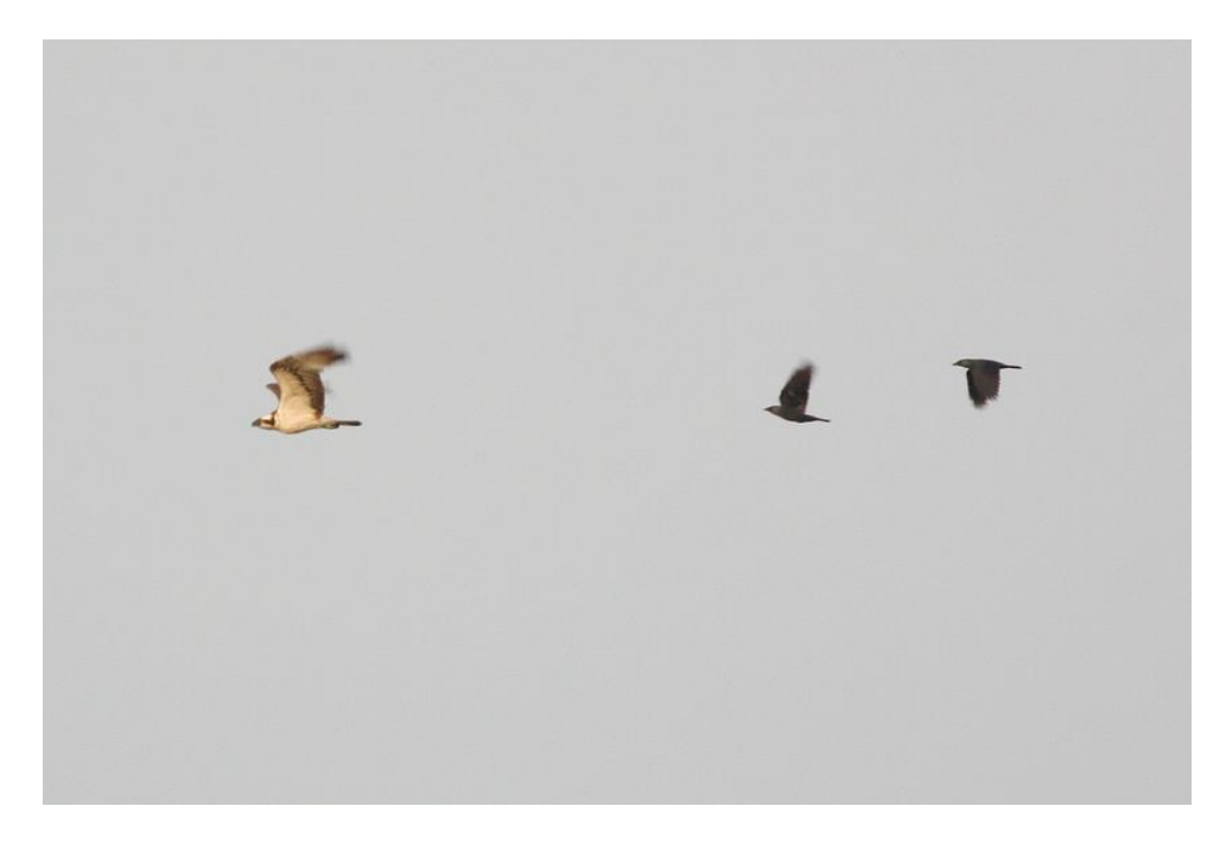
A migrating Osprey at Anglers Country Park, W Yorks , mobbed by 2 Jackdaws.

raptor migration that I've seen was on the island of Kythira, just off the southern end of the Peleponnese peninsula in Greece - the last point before departure across the Mediterranean to Crete. A line of cliffs providing updraughts acted like a magnet to the migrating raptors, and sitting in the sun on top of these cliffs gave exceptionally close views of migrating Booted and Short-toed Eagles, Honey Buzzards, Hobbies and harriers, not to mention a good sprinkling of herons and egrets. Next time you head for the sun, take a good look at the map and see if you can find your own raptor funnel.