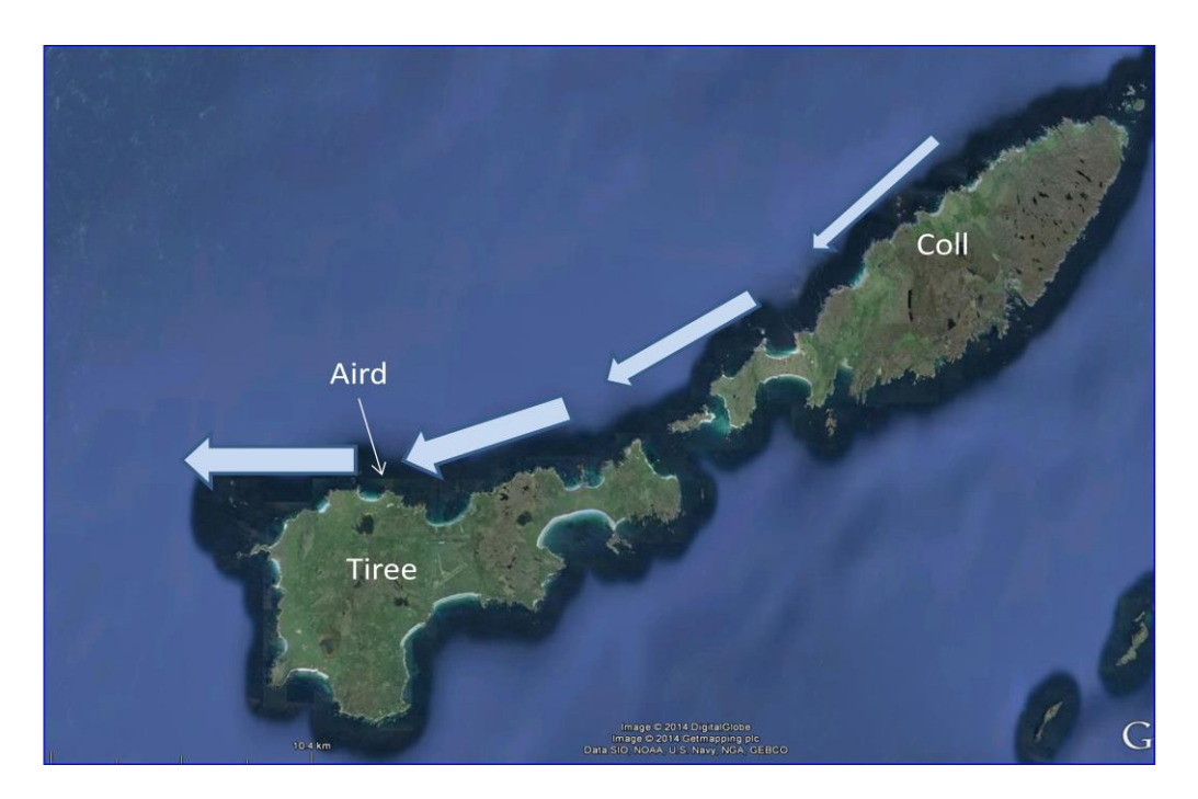
The leading line of the north coasts of Coll & Tiree pushes birds westwards, bypassing sites on the west coast of Tiree.

Never the less, despite all this talk of leading lines and smooth coastlines, not all sites follow these rules, and there are occasions when it seems that the more a site sticks out into the sea, the more seabirds it gets e.g. Cape Clear in Ireland. I think there are days when specific weather systems combine to produce something akin to seabird "falls", when mist, rain or fronts bring birds close to shore, sometimes with dramatic results. Martin Scott and Tristan ap Rheinallt witnessed one such event at the Butt of Lewis on 8<sup>th</sup> September 2007 when a staggering 7, 114 Great Shearwaters (and one Cory's!) passed north westwards out of the Minch.