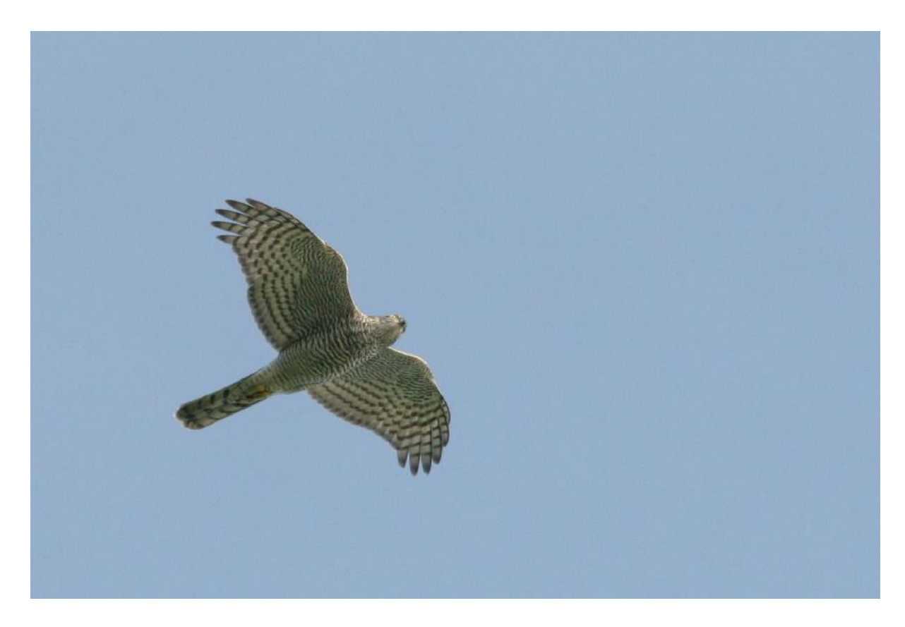
Migrating Sparrowhawk, De Horde, Netherlands.

The three most commonly recorded British raptors during 2005-2013 were Kestrel (1,702 records in total, of which 833 came from Spurn, including a staggering maximum count of 54 on 15<sup>th</sup> September 2010 (a British record?), Sparrowhawk (2,958 individuals, many of which were at Dungeness including the maximum of 52 there on 23<sup>rd</sup> August 2008) and Common Buzzard (2,083 individuals, maximum 70 >S at Spurn on 3<sup>rd</sup> Sept 2010). Most of these counts probably involve dispersing young birds rather than true migrants, although some of the high counts of Buzzards and Kestrels suggest that some continental immigration may be involved. It is notable that raptor migration in the UK is an early autumn phenomenon, starting in mid August and peaking by mid September. So if you're seeing raptors pass over you at this time of year, don't assume they're locals! There is still much to learn about raptor migration in Britain, and with the populations and ranges of some species on the increase, more great days to be had.