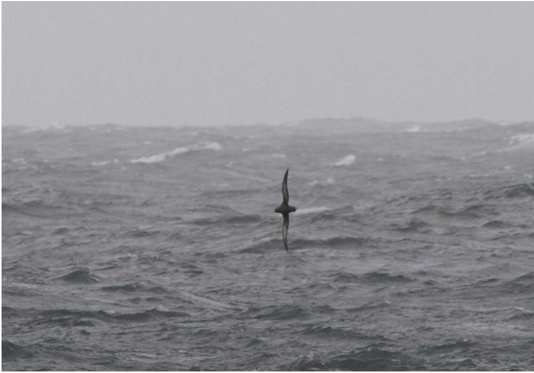
Top birds on any seawatch: Leach's Petrel, Corsewall Point, Dumfries & Galloway and Sooty Shearwater, Rubha Ardvule, S Uist.

One of the great things about seawatching is that there is always a variety of other species on show. Flocks of ducks and waders from July onwards, Pink-footed and Brent Geese in September and Whooper Swans and Great Northern Divers in October. Identifying birds at sea is a particular challenge, and familiarity with your site and your species seems to be the key to success.