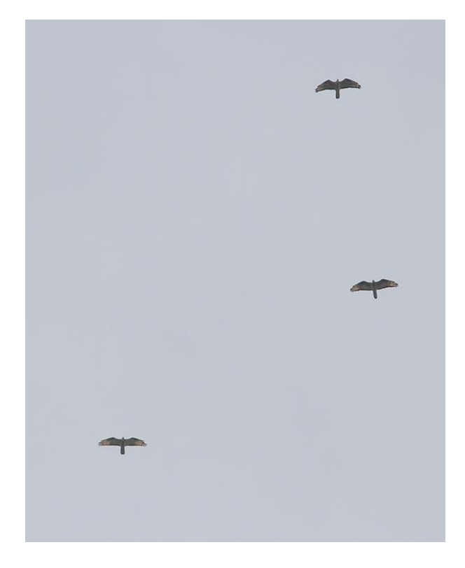
Migrating Honey Buzzards, De Horde, Netherland, showing the characteristic wing shape and pigeon-like heads .