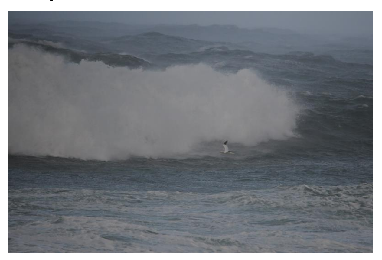
A lone Gannet at Rubha Ardvule, South Uist captures the atmosphere of a seawatch on a stormy day.