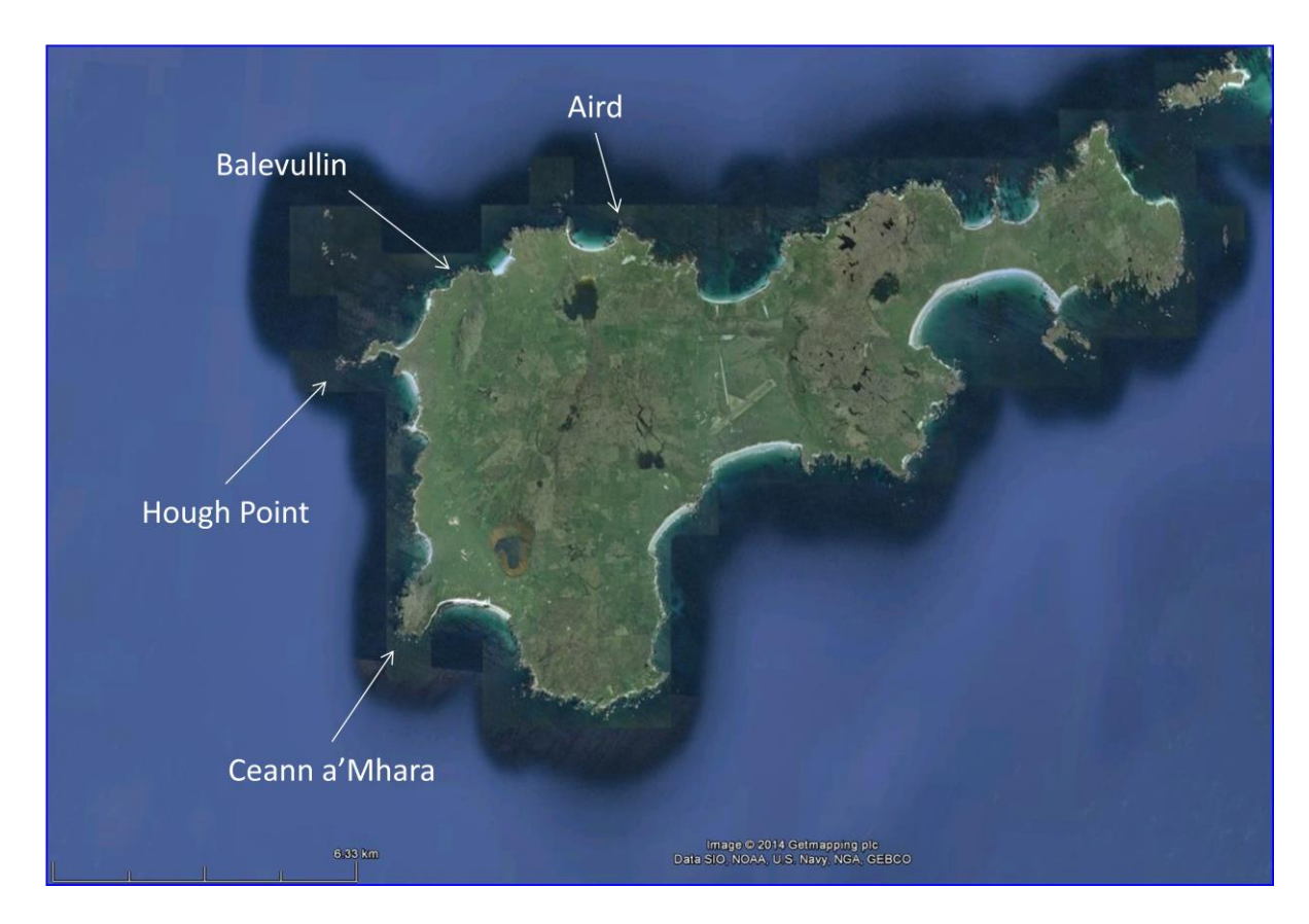
Four autumn seawatching sites on the island of Tiree, Argyll.