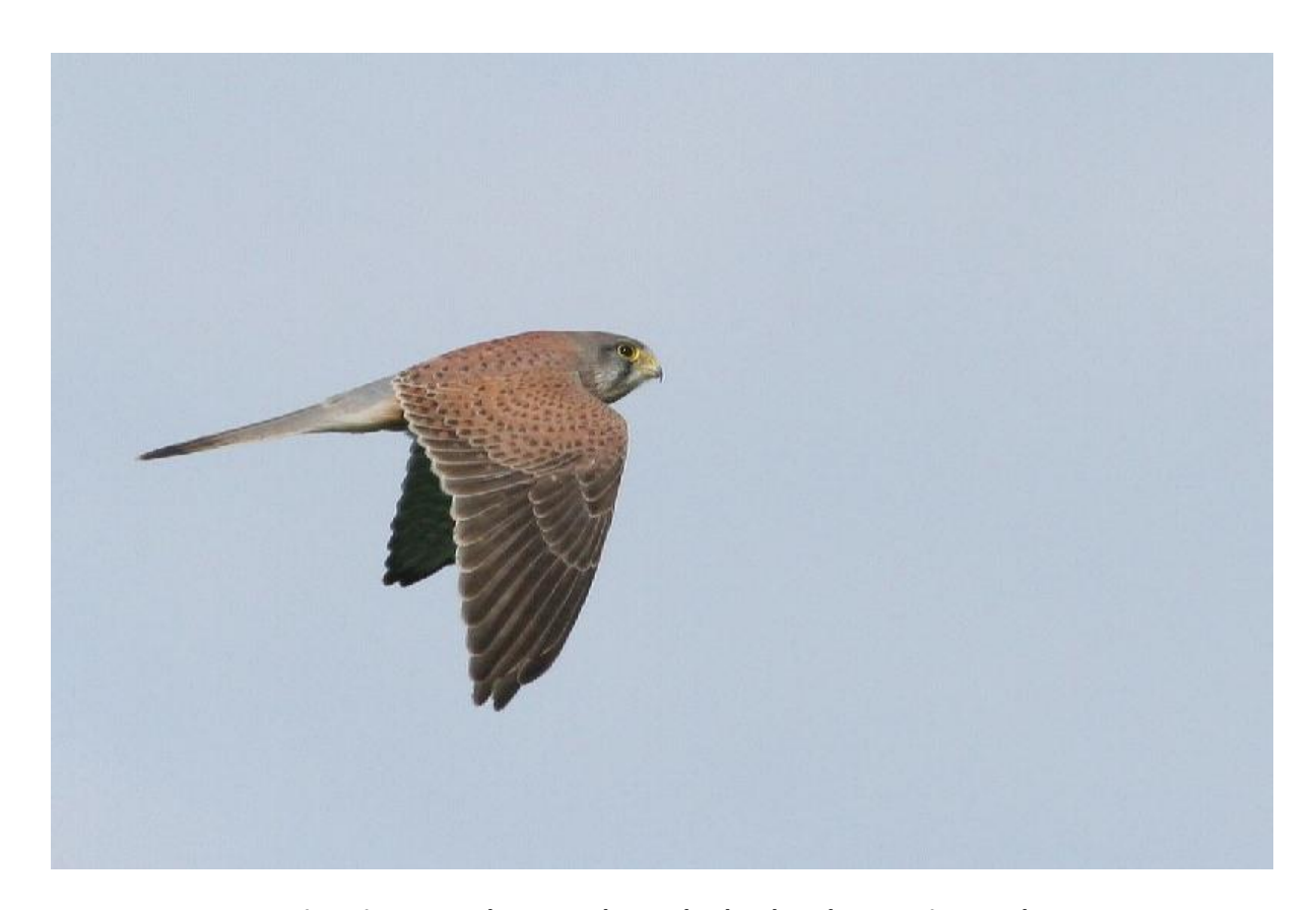
Migrating Kestrel, De Horde, Netherlands.

Raptors numbers recorded on Trektellen Britain 2005-2013